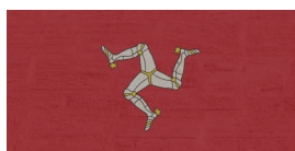
Isle of Man